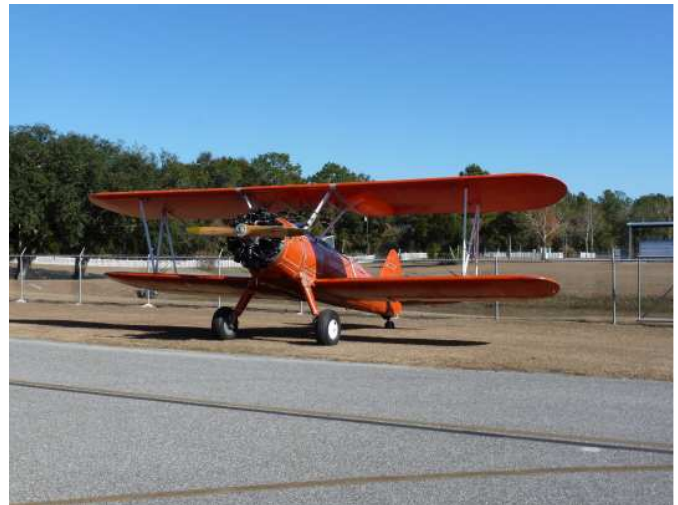
The Stearman is such a beautiful plane. Several members own one.