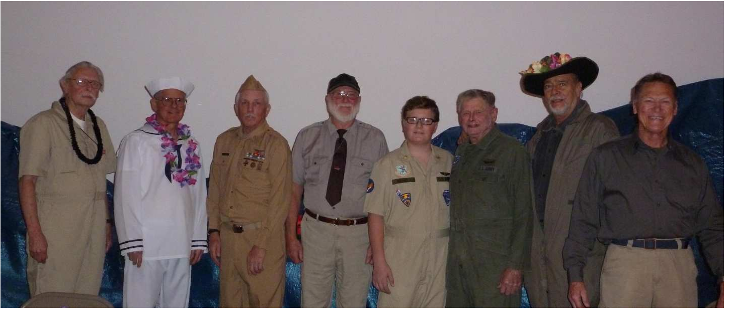
Our "military personnel" in all their glory.