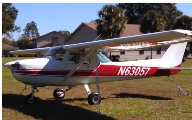
The Flying Club's 150 has a new sibling. See SVFC News

A Pancake Breakfast will be at 8:00 AM. All of our members are asked to share in the fun.