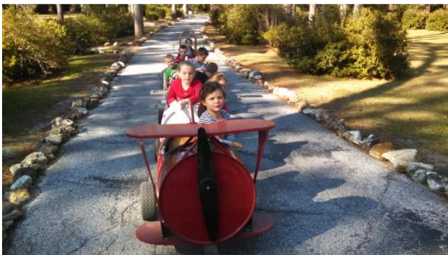
A view down the line..