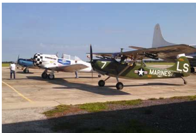
The Ramp @ Keystone

The monthly meeting will be held at the Suwannee County Airport at our EAA Chapter Building at approx. 10:30AM. Pot Luck Brunch will be at 10:00AM. All of our members are asked to bring a dish to share.