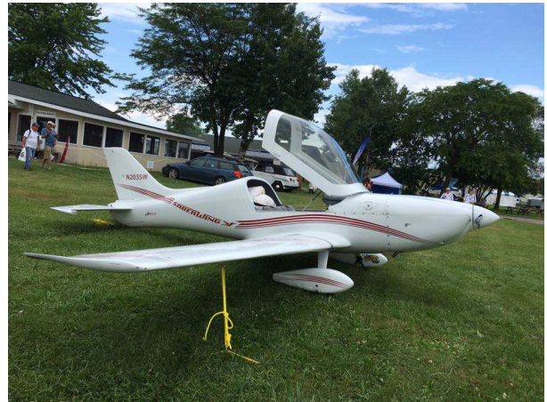
Larry had vinyl graphics applied.

Larry's Sabrewing is to be flown in the AirVenture Showcase at Oshkosh '2017.