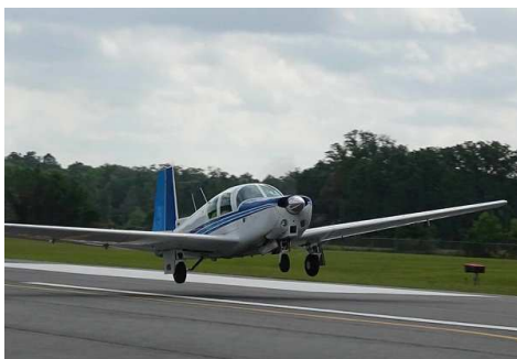
Larry Bothof flew down from Moultrie to help lighten the load.

One of the things that makes our program work is the effort put forth by our volunteer pilots. They put